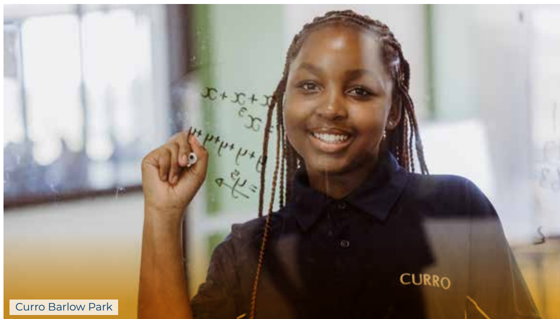
Curro Barlow Park

An internal policy exists to ensure that appropriate governance processes are in place for the approval of individual employees' remuneration and changes thereto. The remuneration of the executive directors, exco members and company secretary (collectively 'executives') is reviewed annually by the remcom,