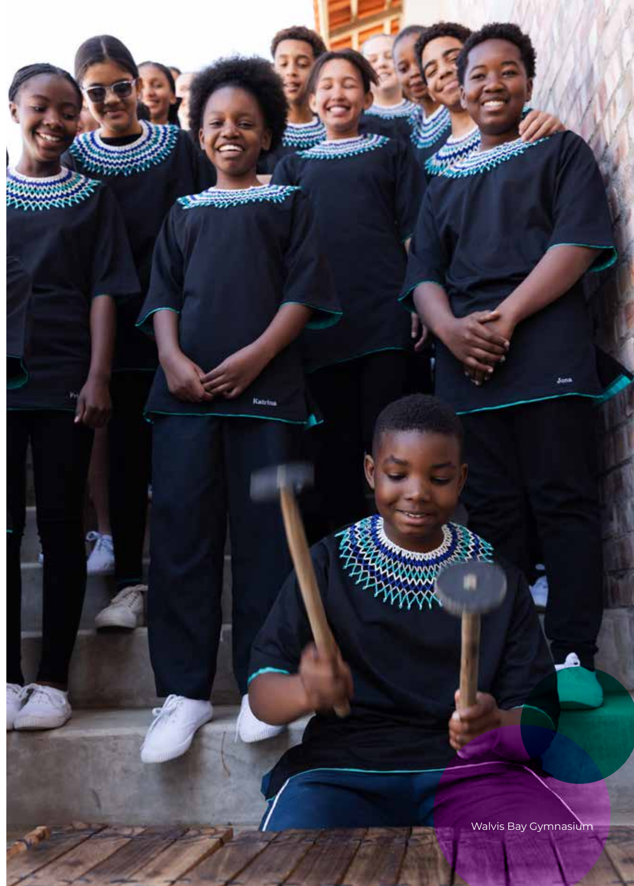
Walvis Bay Gymnasium

In addition to the performance measures above, the remcom set a stretch target for learner growth above 3.3%, with as much as an additional 25% being added to the executive incentives for achievement of up to 6.8% of growth in learners from 2024. The stretch target demands meaningful growth in the context of the prevailing challenging economic conditions and the absolute number of learners already enrolled in Curro.